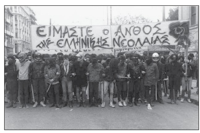
Greek anarchists have played a major role in anti-neoliberal struggle following the global financial crisis of 2007 [See Chapter 10]

The funeral of Mexican anarchist leader Ricardo Flores Magón (1874–1922), Mexico City [See Chapter 4]