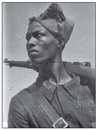
The anarchist revolution in Spain was aided by tens of thousands of international volunteers - anarchist militiaman at Bakunin Barracks, Barcelona, 1936 [See Chapter 9]