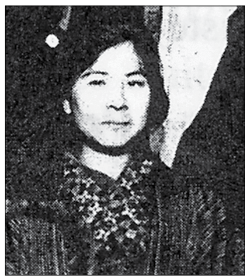
Itô Noe (1895–1923), Japanese anarchist and unionist, murdered by police [See Chapter 6]