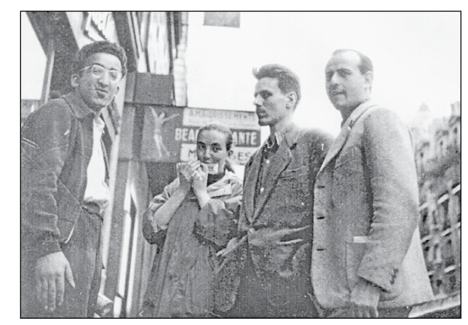
Members of the Libertarian Communist Federation, active in the Algerian indepedence struggle, 1950s [See Chapter 5]