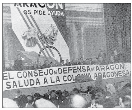
The Committee of Aragon, a bottomup planning body of delegates, linking collectives and militias in revolutionary Spain [See Chapter 9]