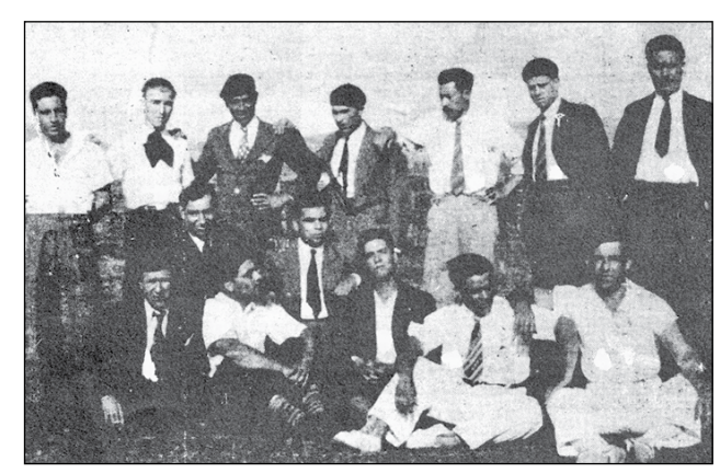
Members of Portuguese anarcho-syndicalist General Confederation of Labour (CGT), jailed by fascist regime, Sao Joao Baptista prison, 1935 [See Chapter 8]