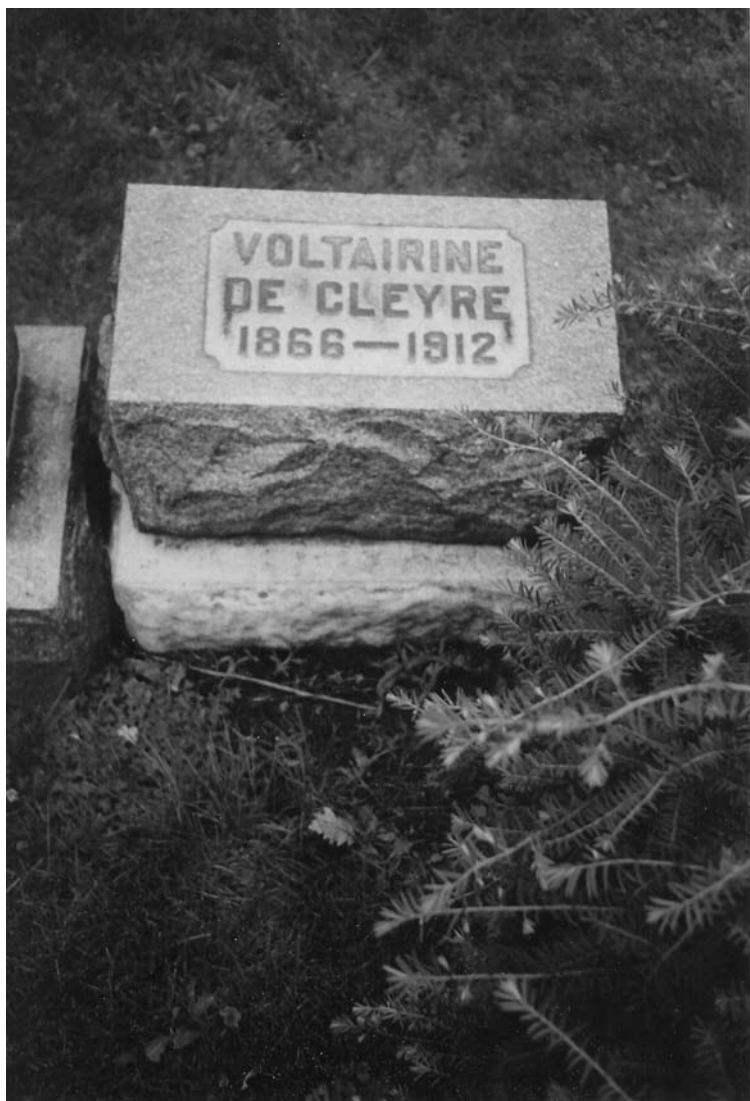
Voltairine de Cleyre's tombstone, Waldheim Cemetery, Chicago.