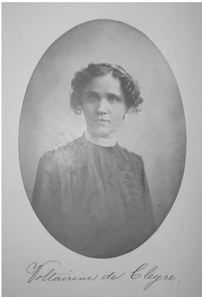
Voltairine de Cleyre, Chicago, 1910.